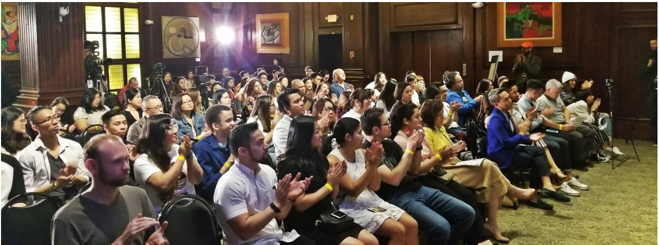
The Kalayaan Hall saw a full capacity crowd during the launch of TFCU Talks last 14 April at the Philippine Center New York.