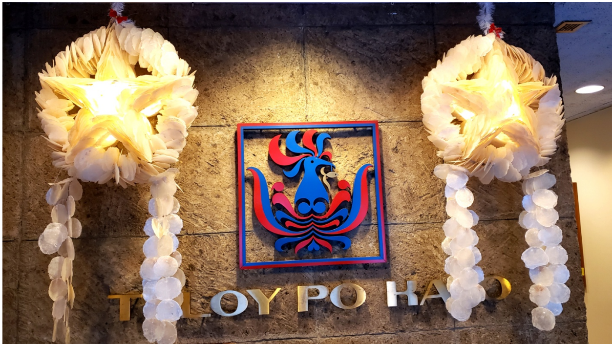
Two large capiz parols welcome guests to the Philippine Center.

For more information, visit www.newyorkpcg.org and www.facebook.com/PHConsulateNY