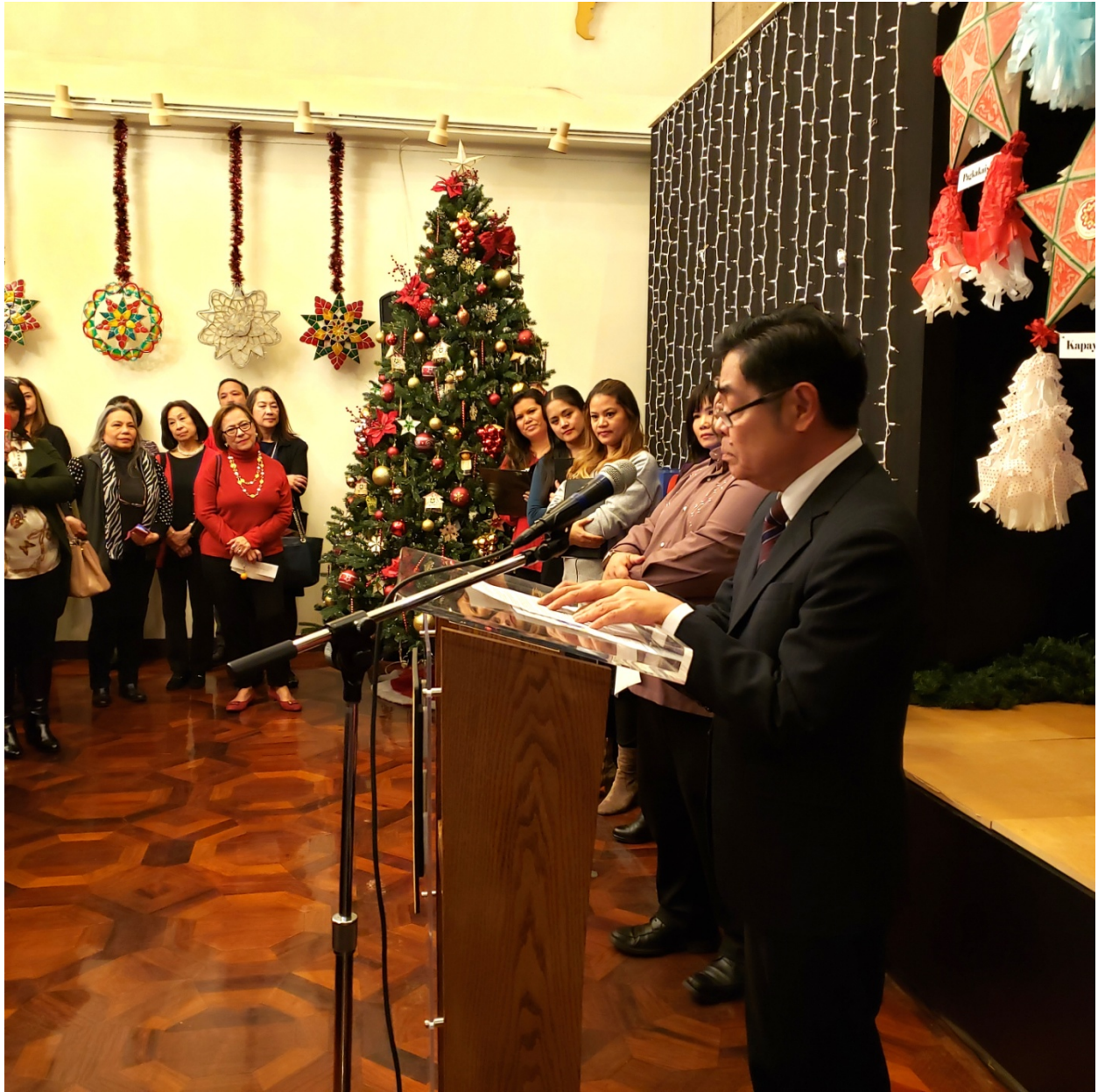
Consul General Claro S. Cristobal (right) welcomes guests to the first night of the Simbang Gabi coinciding with the Parol-lighting and debut of the Feel Pinas window display.

For more information, visit www.newyorkpcg.org and www.facebook.com/PHConsulateNY