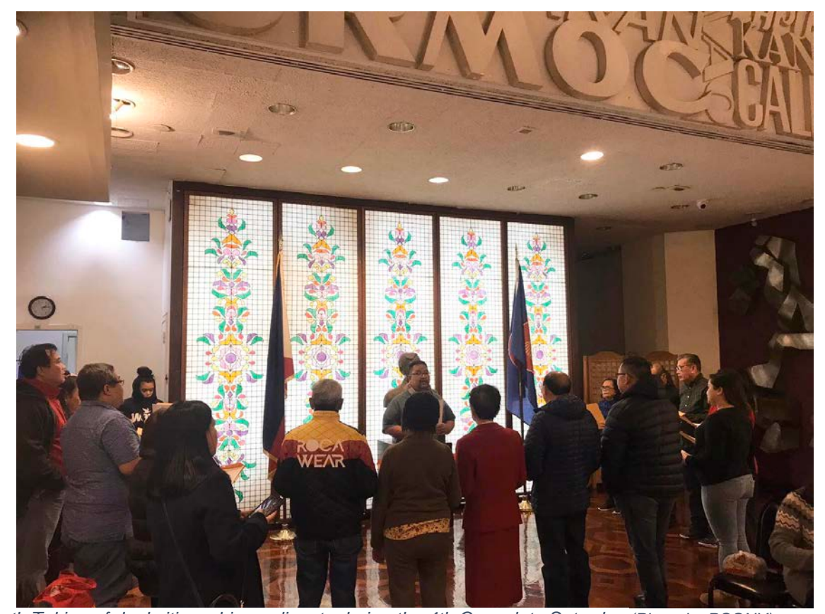
Oath Taking of dual citizenship applicants during the 4th Consulate Saturday

NEW YORK CITY – The Philippine Consulate General in New York conducted its last Consulate Saturday of 2019 on 09 November 2019. 75 Filipinos from all over the Consulate's jurisdiction availed themselves of the services offered by the Consulate, ranging from passports to notarial and legalization services to dual citizenship and civil registration.